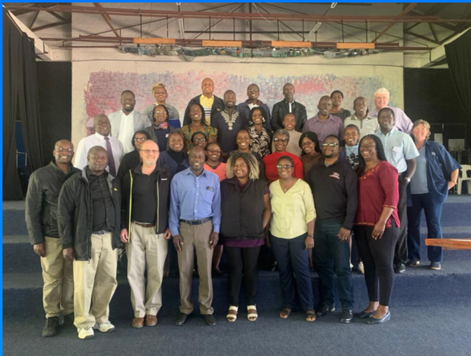
Combined Group: Cohort 3 and Candidate Trainees (2)