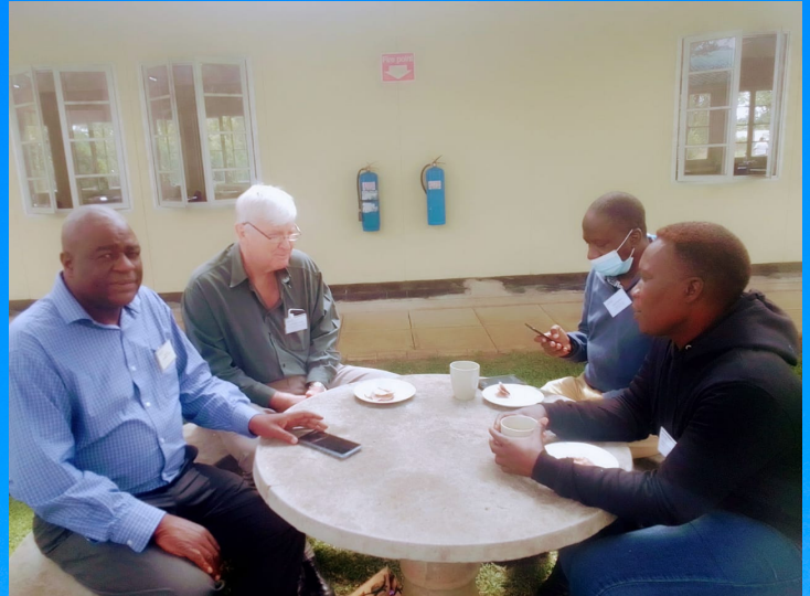
Above : Cohort 3 School Leaders hard at work