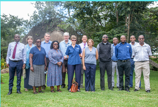
Left: AGM/Board Meeting at Lendy Park School