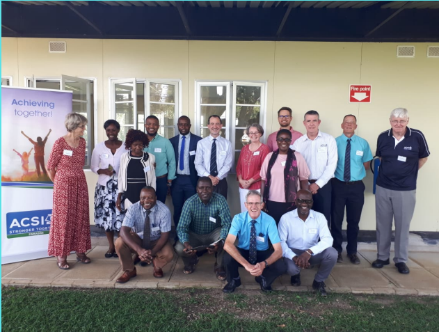
Above : Heads Conference