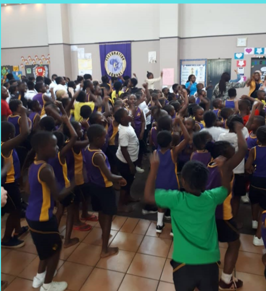
Left: Lively worship session at Celebration International School