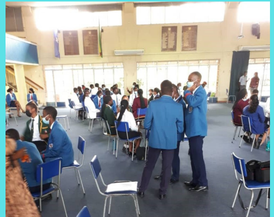
Right: Student Leaders Seminar